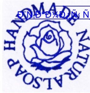
D o N, D o D 1/4 D ζ N ⟨ D D⟩ N · D 1/4 N ⟨ D o N ∈ N f N ‡ D 1/2 D 3/4 D 1 N ∈ D o D ± D 3/4 N, N ⟨ D · D 3/4 D 2 D o N ∈ D μ D 1/2 N ⟨ D · D · D o D 3/4 D 1/2 D o D · D ζ N ∈ D 3/4 N · N, N ⟨ D 2 D ζ N ∈ D · D 1/4 D μ D 1/2 D μ D 1/2 D · D · : D ζ D 3/4 D 1/4 D μ N · N, D · N, D μ D · D · D o N · D · D o N · D · N ∈ N f D 1 N, D μ N ~ N, D o D 1/4 D ζ D 1/2 D o D 1 D 3/4 N · , D 3/4 N ∈ D 1/4 N ⟨ (D 1 D 1/2 D 3/4 N · , D 3/4 N ∈ D 1/4 N ⟨ D D⟩ N · D 1/4 N ⟨ D o D 1 D 3/4 D o D 1/2 D 3/4 D ± N ⟨ N, N ∈ D 3/4 D 2 D 1/2 N ⟨ D 1/4 !) D · D o D o D o D μ D 1 N, D μ D 1/4 N ⟨ D o N ∈ D 1/2 D 3/4 D 1 D 3/4 N · D 1/2 D 3/4 D 2 D 3/4 D 1 . D o D o D 2 D o D μ D o D · N, D μ D 1/4 N ⟨ D o D 3/4 D · D · N · , D 3/4 N ∈ D 1/4 N ⟨ D · D o D o D o N f N ∈ D o N, D 1/2 D 3/4 D 3/4 N, D 1 D μ D o D · N, D μ N ~ N, D o D 1/4 D ζ â€ “ D 2 N · D μ D 3/4 N, D 3/4 D 2 D 3/4 !